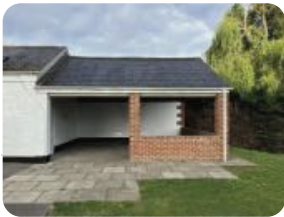
Proposed image of Hungerford's Community Shed

We'll keep you updated as plans progress and building work begins. This is a truly exciting opportunity for Hungerford, and we can't wait to see it come to life so stay tuned for more updates in the coming months!